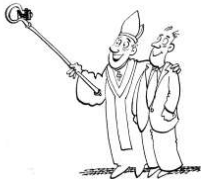
Bishop's Selfie Stick