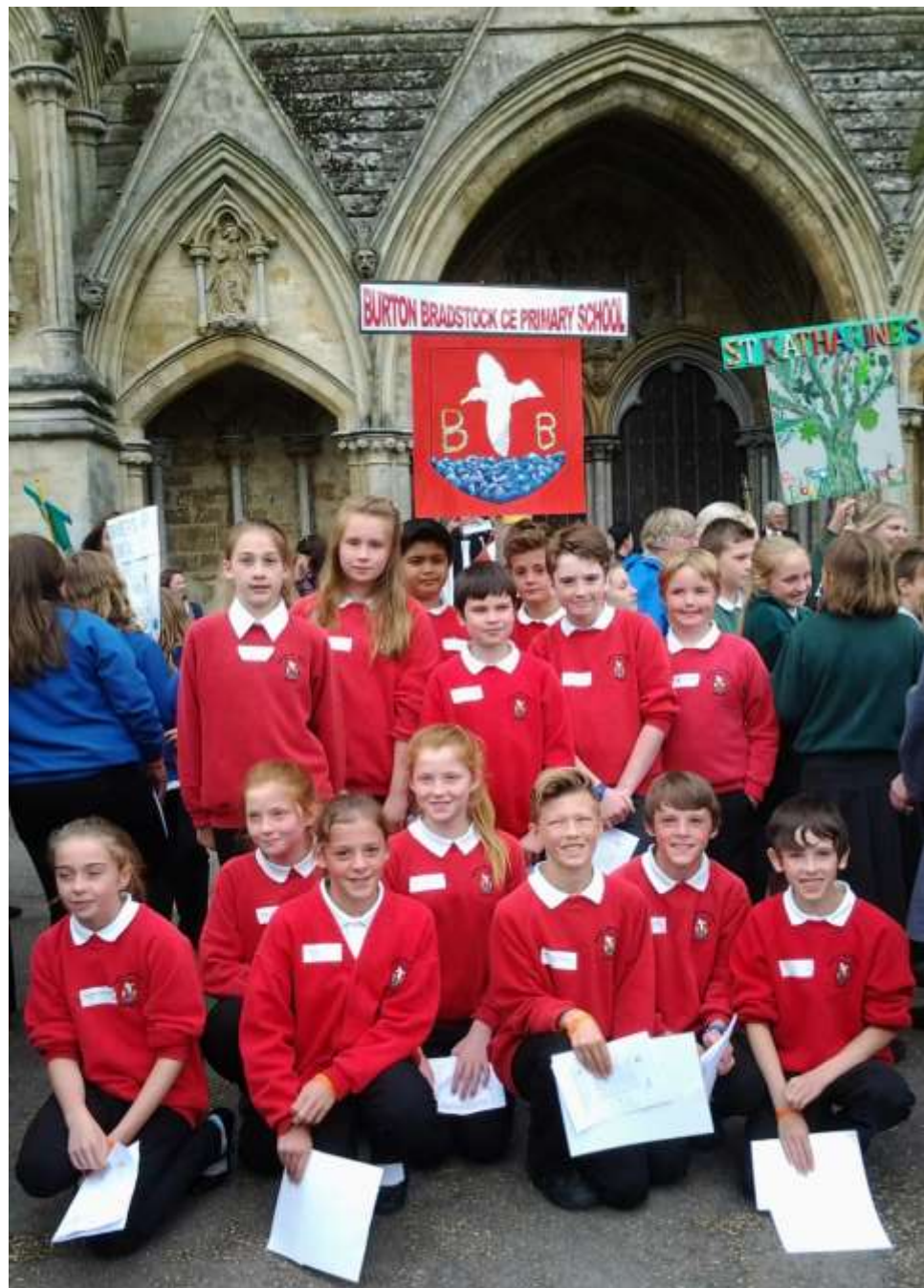
Burton Bradstock School Leavers at Salisbury Cathedral