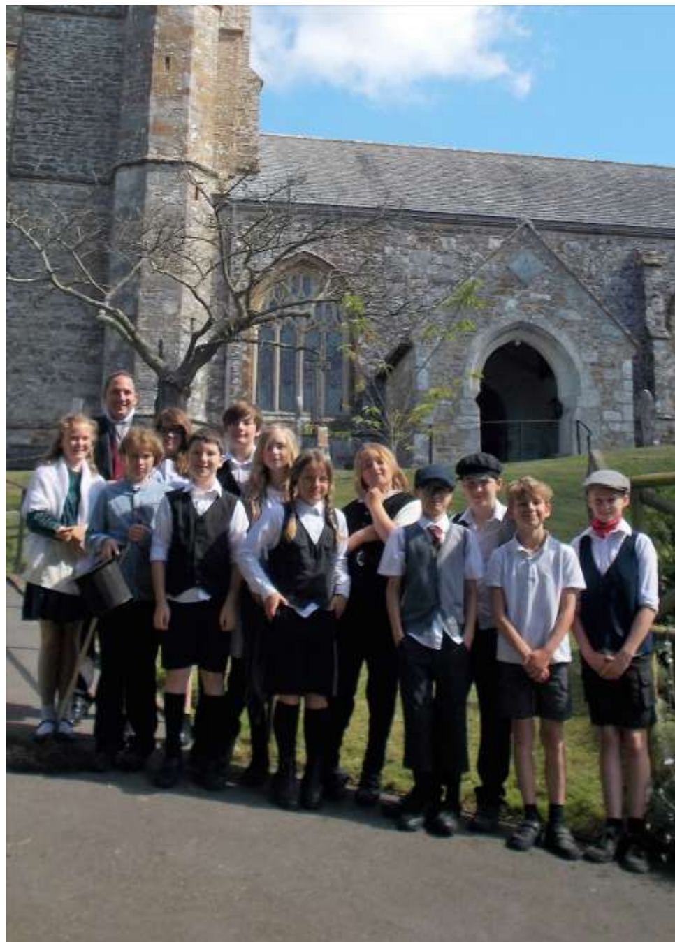
Thorner's School 35th Anniversary at Litton Church